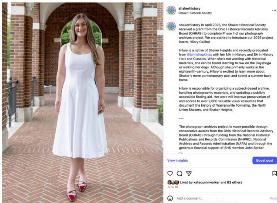
Posted June 18, 2025 on Instagram and Facebook