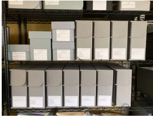
Photograph Archives Boxes 1-14 containing over 1,650 rehoused photographs..

The project has had an immediate positive impact on both archival care and overall museum operations. Rehousing 1,700 photographs and photographic media created additional storage space in the archives for other collection materials. Framed photographs were relocated from the floor, where they had been stored for years, to dedicated shelving. Museum staff have since made extensive use of the photograph archives for research requests, educational outreach, and exhibition preparation. This project phase also enabled us to begin transferring and responsibly disposing of photographic materials that were duplicates, low-quality reproductions, or outside the scope of our collections.