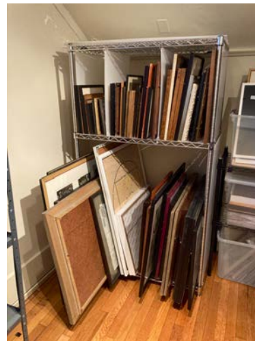
(Left) Prior storage of framed photographs; (Right) Framed photographs were moved from the floor to wire shelving with Coroplast “siding” and dividers.