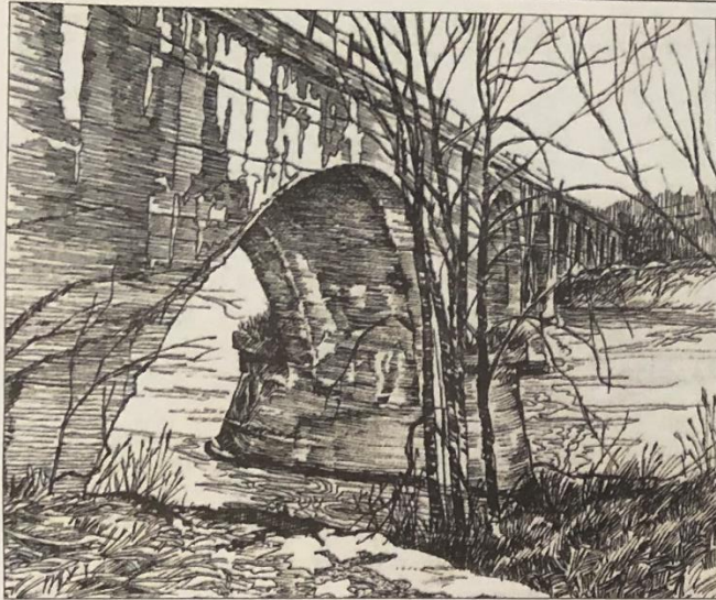
The Waterville Historical Society has more than 100 images of the Roche de Boeuf Interurban Bridge online at www.watervillehistory.org .