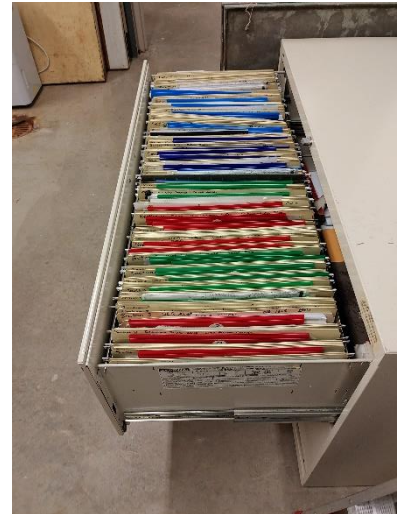
After Second Work Session