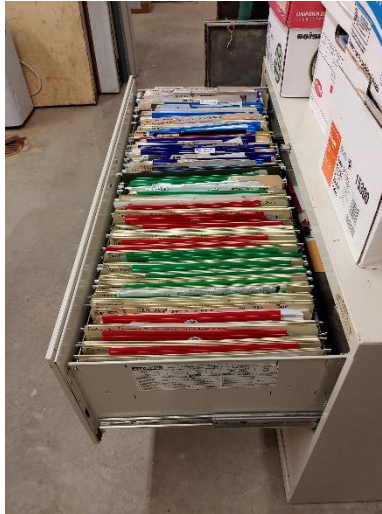
After First Work Session