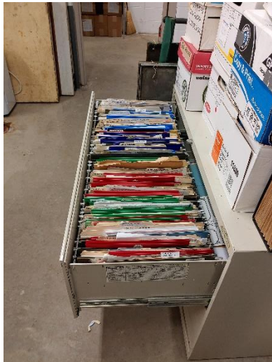
Before Grant Project