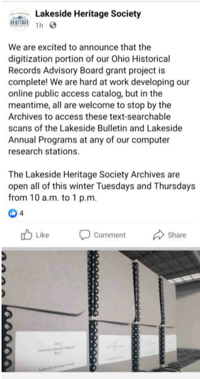
Image 3: Post made to LHS Facebook page announcing availability of scans at our research stations, December 2021.