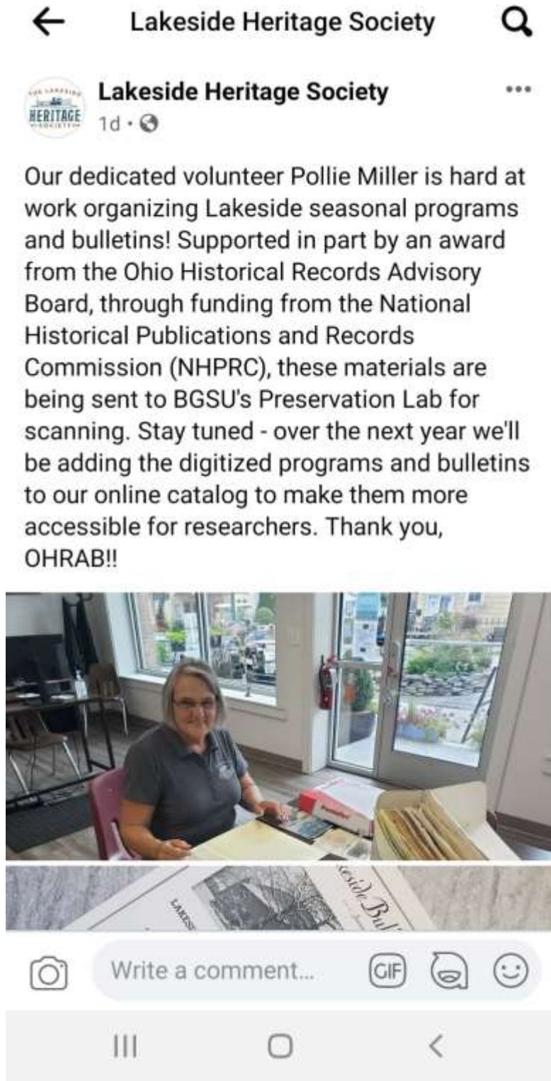
Image 2: Post made to LHS Facebook page promoting the project, August 2021.