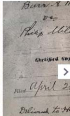
Licking County - Records And