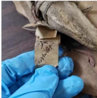
Licking County - Records And Archives

We are now in the process of cleaning Bills of Exception, Partition Records, and Naturalization documentation. Stay tuned for a full list at the end of the grant period. Here are some photos from a recent find in our Bills of Exception case files. This case included, believe it or not, horse bones!