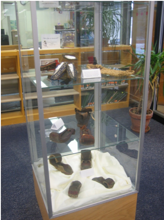
Display case at library entrance

Artifacts from the collection have been used in general displays in the library and were included in the EFC-ER Bicentennial Symposium and during their Yearly Meeting. In addition to the displays promoting the collection, the receipt of the grant and the resulting archival work was mentioned in a radio interview with Amy Yuncker on 1480 WHBC's Pioneer Radio program on July 19, 2012. As visitors have seen the collection displays and learned that we have begun a systematic effort to preserve, catalog, and improve accessibility for the entire Friends Historical Archive, we have begun to receive offers of other related donations.